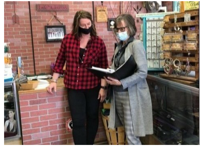
Arrow Gift Shop - Eagle River, WI