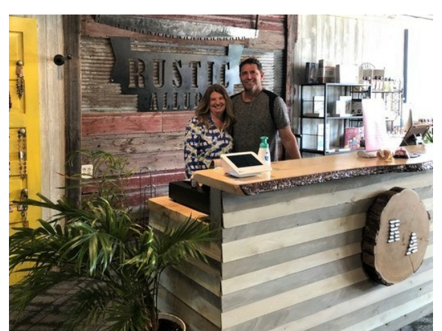
Rustic Allure - Eagle River, WI