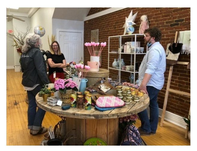
Busy Bee Floral, Monroe, WI