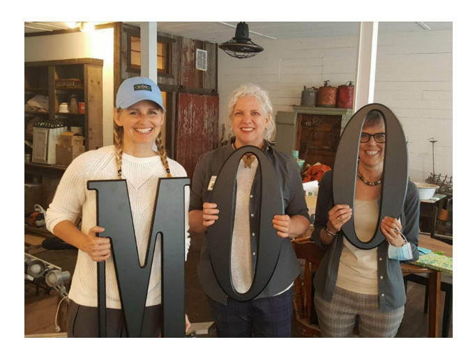
Wisconsin Milk House - Osceola, WI