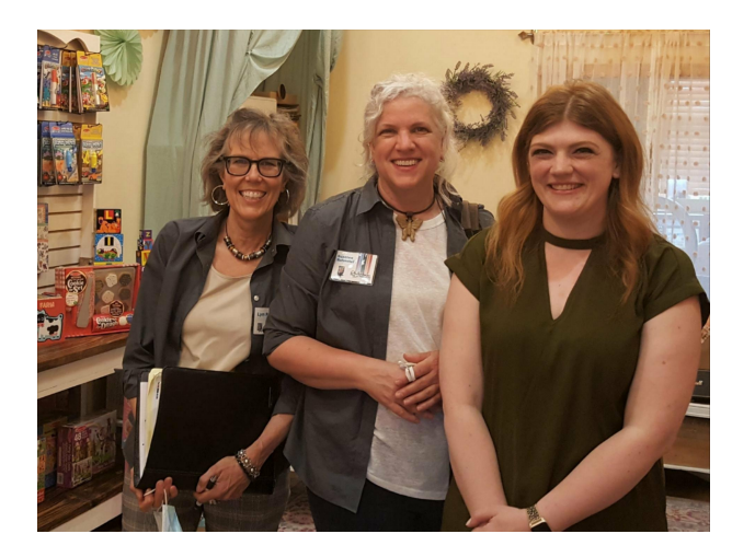
The Sleepy Thicket - Osceola, WI