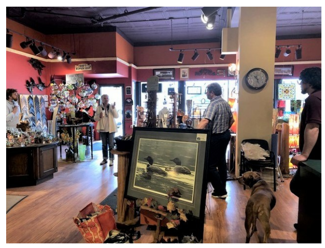
Frame N' Color - Monroe, WI