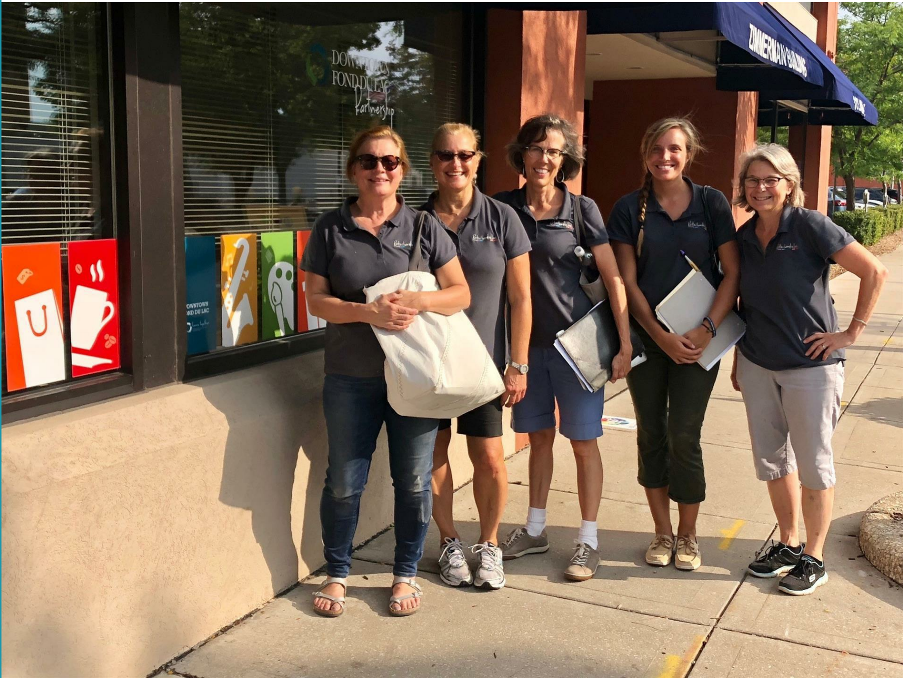
Design to Watch: Graduate Hotel