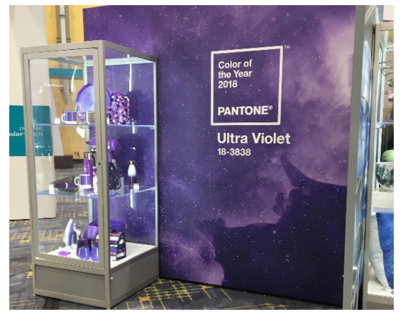
A display featuring products colored with the Pantone Color of the Year at the International Home and Housewares Shoe