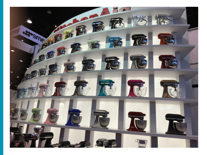
A rainbow wall of colorful Kitchenaid Mixers at the International Home and Hosuewares Show