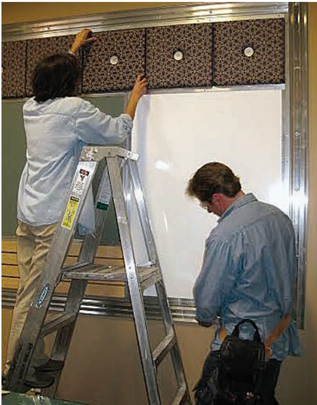
Simply changing out the finishes on a “communications board” can bring visual pop to a focal point wall.

can sit at the front of a department to capture attention. Of course, make sure they coordinate with the other fixtures in the department. Fixtures need to complement one another and support the merchandise. They should never be a visual distraction.