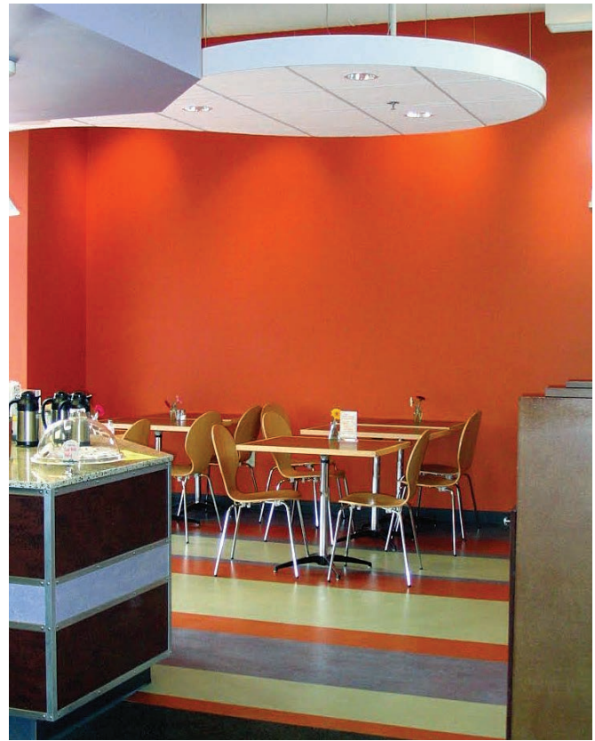
Don't be afraid of color. Above: Outpost Natural Foods Cafe, Bay View, WI.

4) Re-faced Front for the Service Counter. Relocating a checkout counter can be problematic due to power and phone cords, and data lines; however, updating the vertical face of a counter can be the inexpensive “pop” that enhances the entire checkout area. Generally the largest piece of “furniture” in the store, and what I think of as its “heartbeat,” your service counter should always look great . Fix any nicks and repair the chips. If you can replace the countertop, all the better – but if you’re just looking for a quick fix, then paint the front, or re-face it with a material that works with your “brand” – such as corrugated metal, fabric or wall covering. Heck, I’ve even put textured vinyl flooring on the front of a counter! The